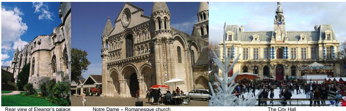
Rear view of Eleanor's palace

The city of Poitiers places great importance on its international students. The Municipality has formed strong links with the higher education institutions and each year, different activities are organised to help the international students integrate Poitiers. Welcome days are organised in October and March giving the opportunity to discover the city thanks to a pedestrian rally, to meet other French and international students from other schools, to listen to music, and to taste a variety of delicious specialty foods. The Mayor and his team participate in these events and always show their interest in the diversity of nationalities present in the City. International students also have the opportunity to meet and get to know a French family in Poitiers. More and more families are keen to participate in the network and welcome international students for dinner, for a visit of the region or a weekend.